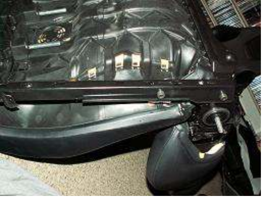
Side Cover removed

There are 4 screws on the inside. They are tough to access so I would recommend a small screw driver. There is also a plastic clip attached to the metal frame by the reclining assembly. You can use a screw driver to bend it out and then pull the plastic side cover right off. Careful not to break the clip off as it is very important to keeping the side cover secured.